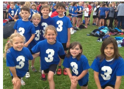
Year 3 Relay Teams