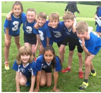
Year 4 Relay Team

Childwickbury Arts Fair Musical Larks in the Park St Albans Hockey Club