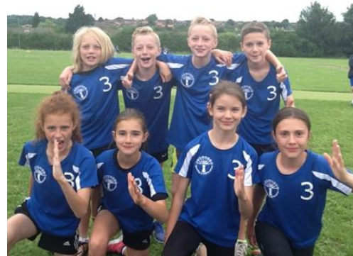
Year 6 Relay Team