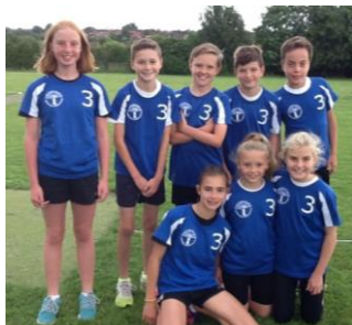
Year 5 and 6 Field Events

Click on the WisePay logo for online school payments; or the Spend and Raise logo below to raise funds for the PA when you shop online.