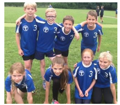
Year 5 Relay Team