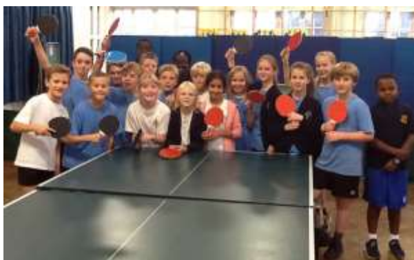
Table Tennis Coaching

On Monday 16 th October 2017, the year 5 and 6 Girls' Football Team played the last two games of their football league. The first was against St. Helens which they lost 2-1 and the second game was against Sauncey Wood, which they won 3-1. The girls have displayed some good football skills and have shown massive improvement in working as a team!